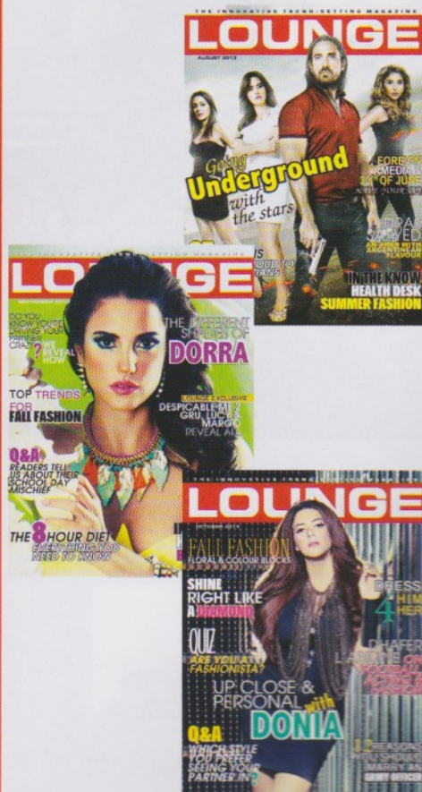
LOUNGE'S COVER: NELLY KARIM